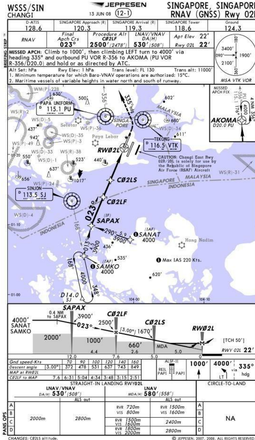
Figure 20.1 RNAV (GNSS) Approach Chart with LNAV and LNAV/VNAV Minima